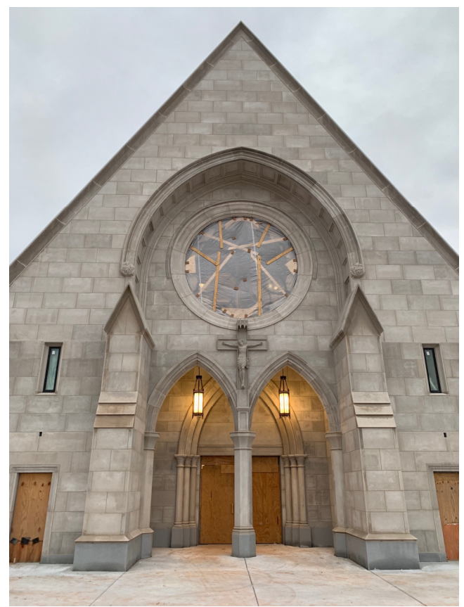
WEST ENTRANCE LIGHTING INSTALLATION AND SIDEWALKS