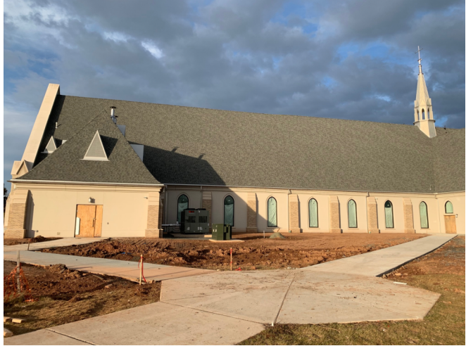
SIDEWALKS AT SOUTH ELEVATION