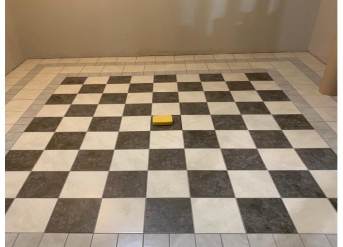
CERAMIC TILE AT CRY ROOM