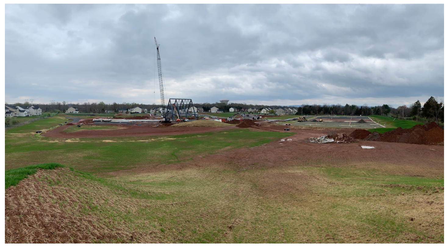
PANORAMIC VIEW OF SITE FROM NORTH EAST CORNER