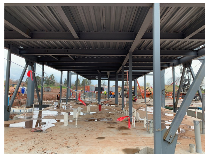
STEEL ERECTION AND DECKING AT SOUTH SERVICE WING