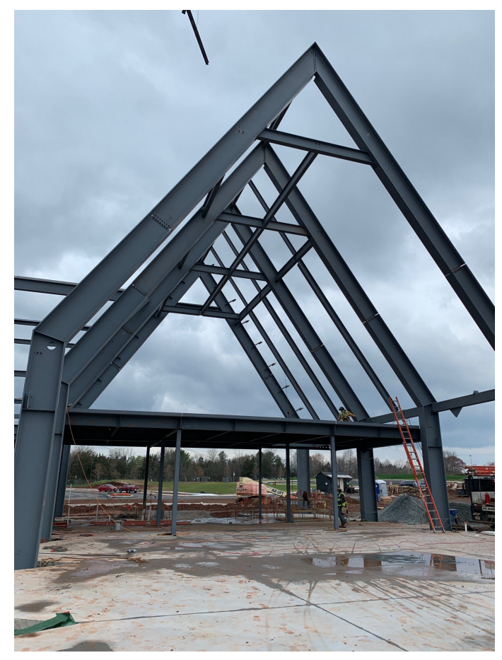
STEEL ERECTION AT NARTHEX